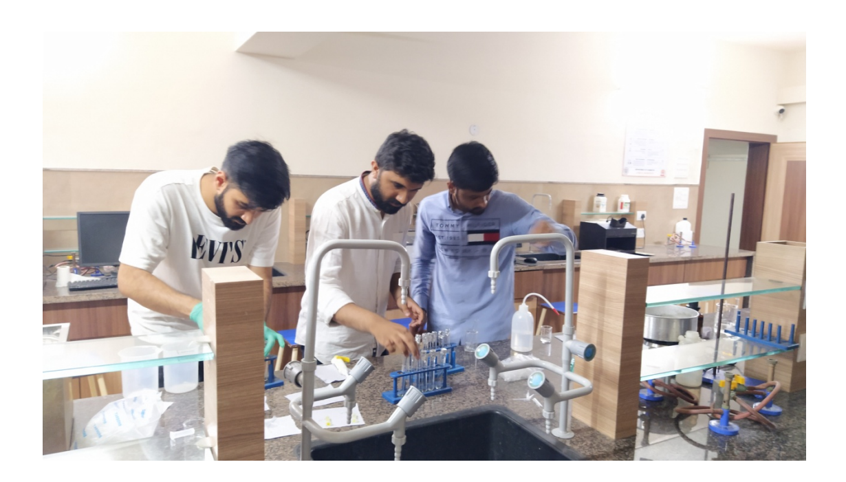
Enzyme ( \alpha -amylase) and sample preparation in micro-molar scale (Chemistry Lab No. 314)