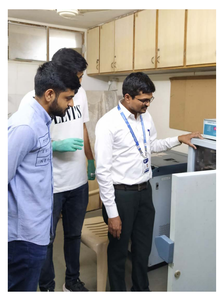
Incubation of samples in Orbital Shaker Incubator (Microbiology Lab)