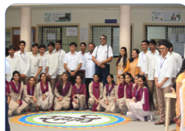
Industrial Interaction with student